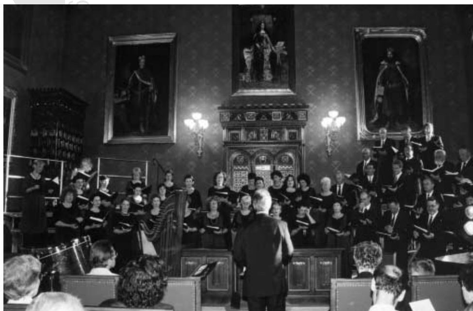
The Concert in the Aula Magna of the Collegium Novum

ers' pieces like Gershwin and Bernstein.