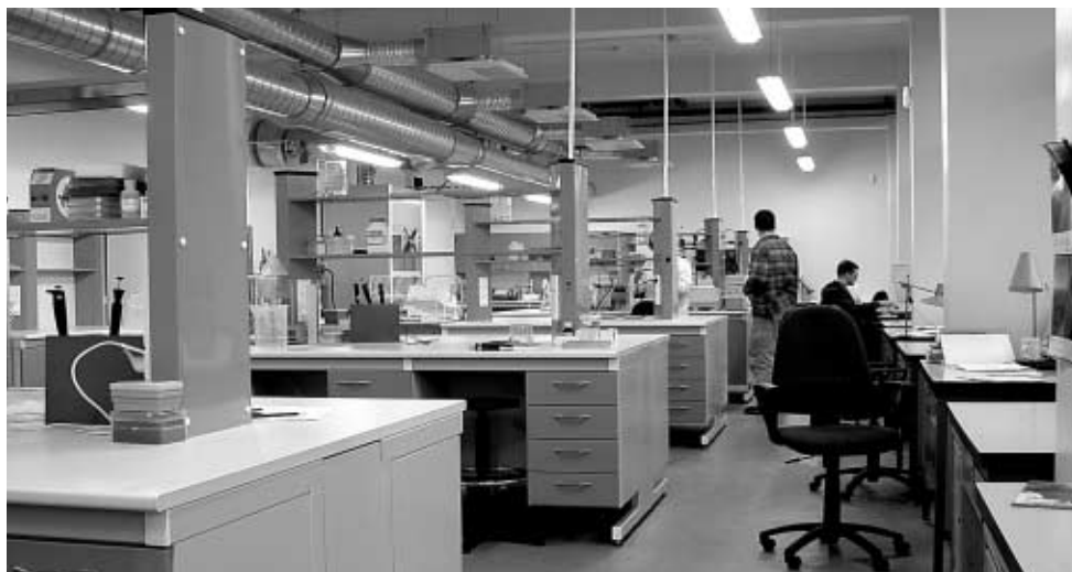
A biotechnological laboratory

The detailed curriculum of the Studies might be checked out at our web-site: http://www.mol.uj.edu.pl