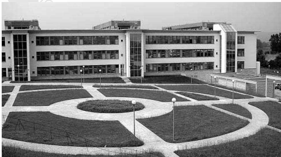
Institute of Molecular Biology and Biotechnology