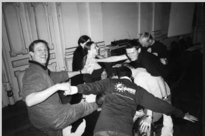
Team building session at the City Hall of Kraków