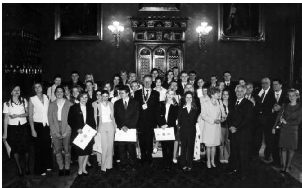
The completion of the 5 th year of the School activity